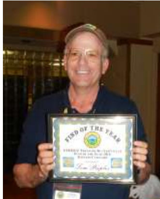
Tom Peeples Jewelry Hammered Silver Coin Earring