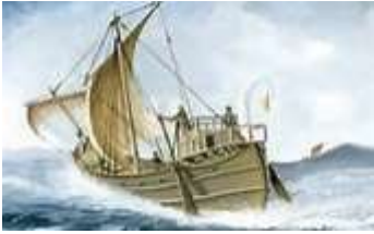
Roman Merchant Ship