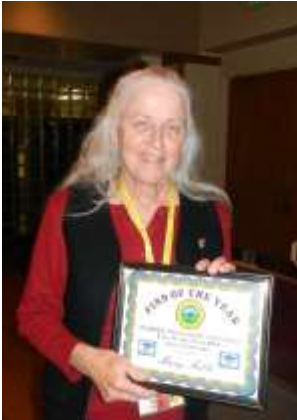
Mary Sable Gold 14K Ring with Five Large Diamonds