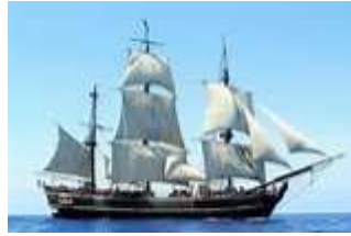
English Merchant Ship 1700s