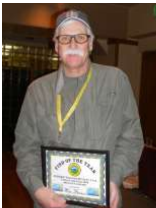
Win Faires Artifact Union 6th Infantry Badge