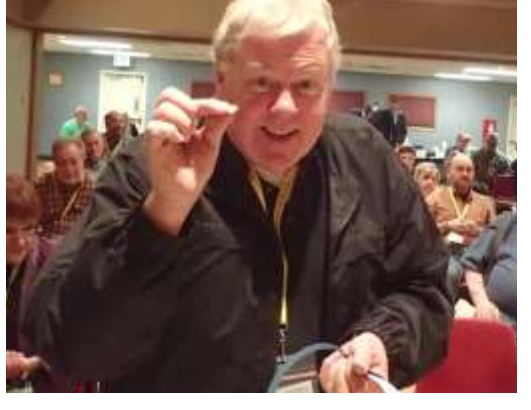
Drawing tickets are $1 each, take a chance.

25. Rush to the Rockies Info and Entry Form